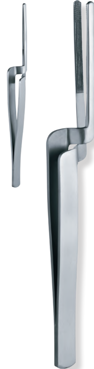
MILLER - cm 15 6730.Y0.01 Dritto Straight