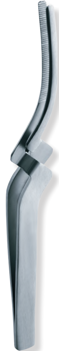
MILLER - cm 15 6730.Y0.02 Curvo Curved