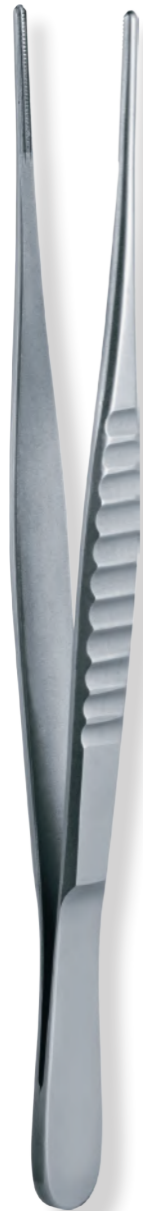
ATRAUMATIC - cm 15 6715.Y0.16