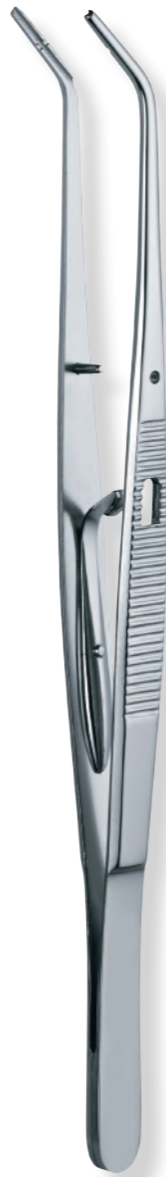
cm 15 - guttaperca 6725.Y0.02