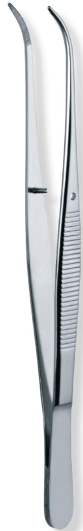
SEMKEN - TAYLOR 6705.Y0.02