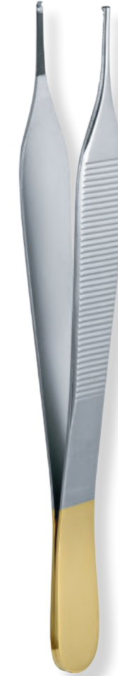
ADSON - cm 12 6719.Y0.12TC