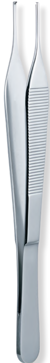
ADSON - cm 15 6719.Y0.15