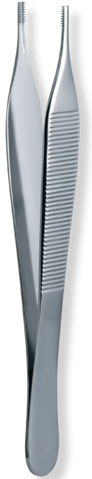
ADSON BROWN cm 12 6720.Y0.12