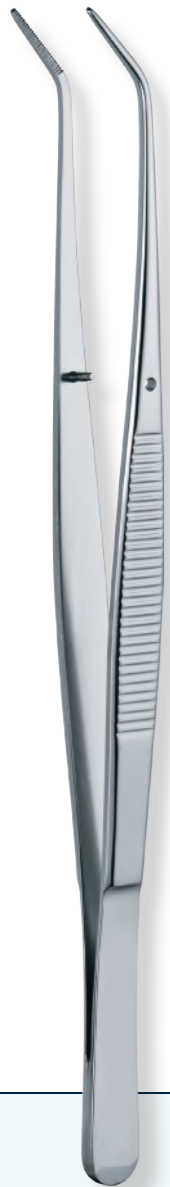
LONDON - COLLEGE cm 15 6700.Y0.02