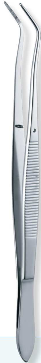
MERIAM - cm 16 6700.Y0.03