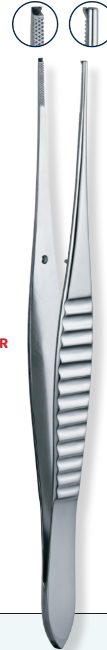
GILLES - cm 15 6711.Y0.15