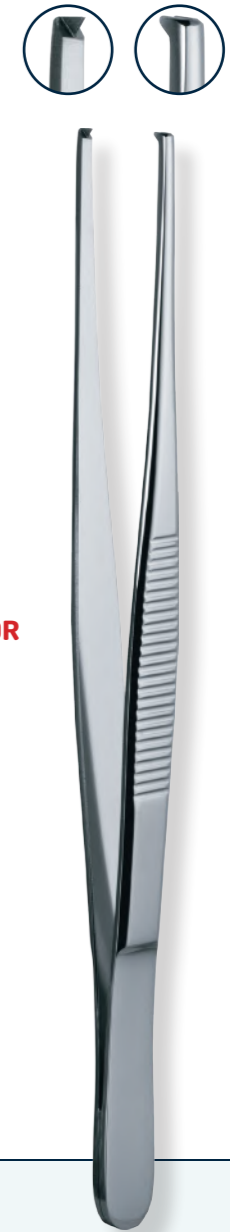
cm 14 6712.Y0.14