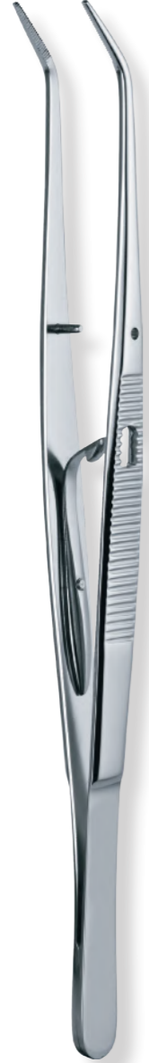
cm 15 - guttaperca 6725.Y0.01