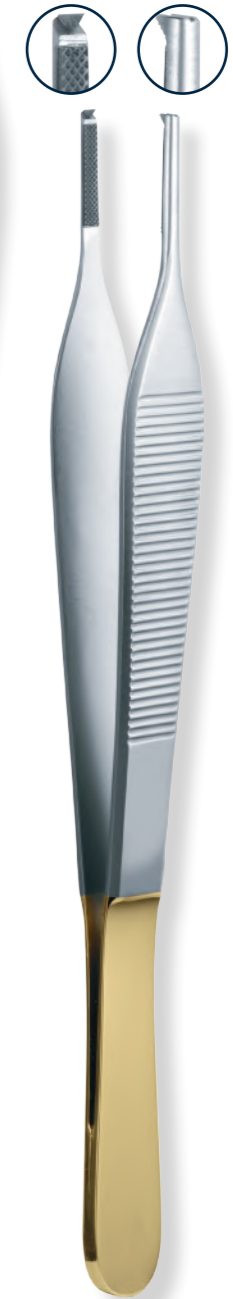
ADSON - cm 15 6719.Y0.15TC