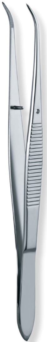
PERRY - cm 13 6708.Y0.02