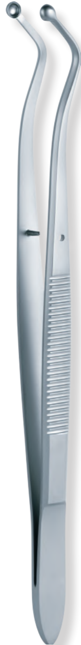
HEMINGWAY - cm 17 6790.Y0.01