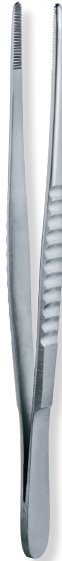
TITANIUM - cm 15 6750.Y0.15