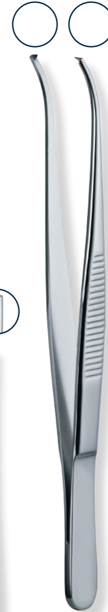
SEMKEN - TAYLOR 6705.Y0.52