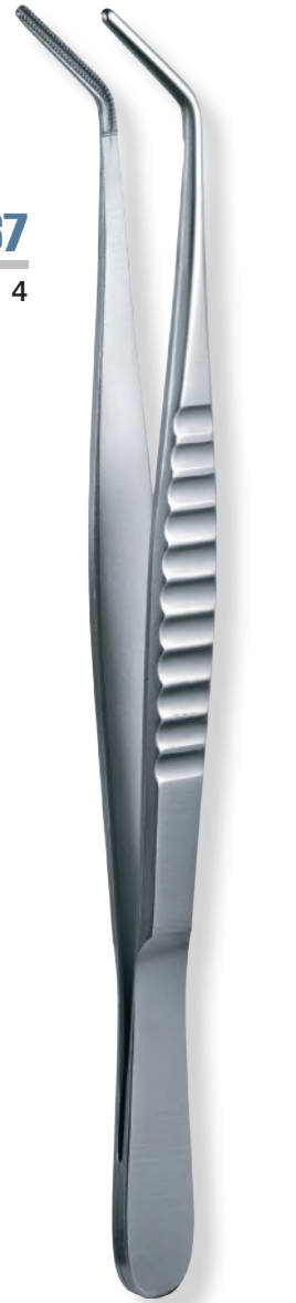
ATRAUMATIC - cm 15 6716.Y0.16