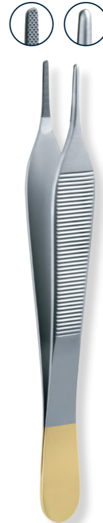
ADSON - cm 12 6718.Y0.12TC