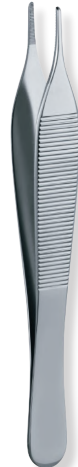
ADSON - cm 12 6718.Y0.12