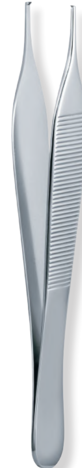
ADSON - cm 12 6719.Y0.12