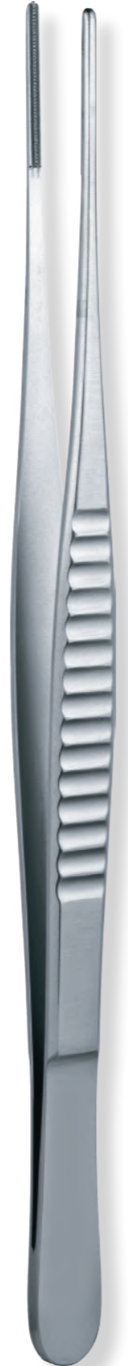
ATRAUMATIC - cm 20 6715.Y0.20